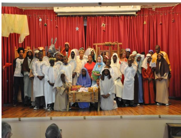
The cast of our Christmas play

We chose a representative team of learners and trainees to report on our Christmas play and the Feast of Don Bosco. On 14 February they received basic training on how to do an interview. They were excited and proud about having been chosen to do this job. Most of them started the next day and I saw them