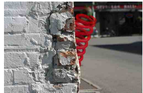
Spring is around the corner!

As I write this we do not know where we stand with the strike. Government has made a new offer! Michael Rua school, with its 900 pupils has been severely disrupted these last few weeks. A trickle of pupils attend each day...but the busses run their routes as usual!