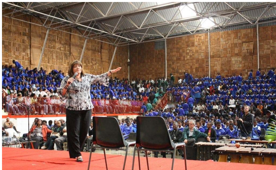
The Bosco Arena in Manzini was filled to capacity with 4500 scholars